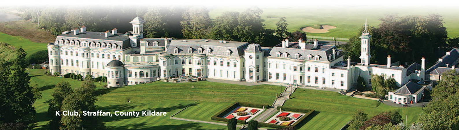
K Club, Straffan, County Kildare

Working with its academic partners, San Telmo International Institute ( www.santelmo.org ), and IESE Business school (ranked number 1 in Executive Education Programmes globally, by Financial Times in 2015 and 2016), the Timoney Leadership Institute is bringing together international academics and business practitioners to run highly interactive programmes for today's leaders.